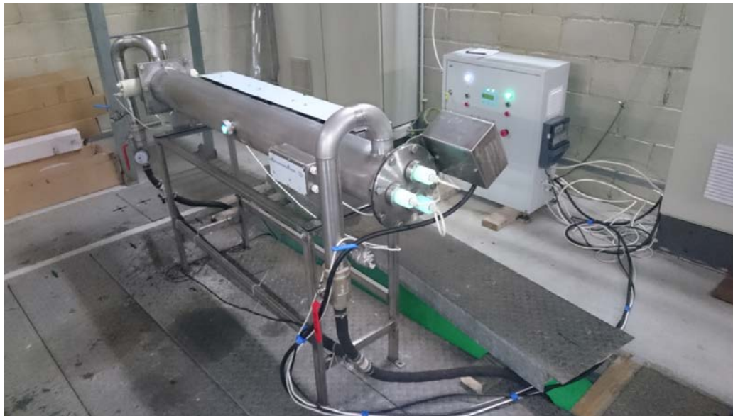
Fig. 1. UOV-SV-5 unit installed in the testing facility

UOV-SV-5 was tested at South-West Wastewater Treatment Plant (SWTP) of Vodokanal of St. Petersburg from October 2015 to December 2016. The unit was placed in the SWTP ultraviolet treatment facility which receives the waste water after primary and complete biological treatment. According to the chemical analysis results, suspended solids made up 5,0-10 mg/dm 3 , and chemical oxygen demand was 20-40 mg/dm 3 . (It should be noted that after the water treatment with the unit these measures did not change significantly).